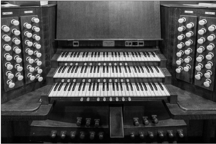
Holy Trinity Ramsgate F H Browne console

Its specification is: Great Organ, 16 8 8 8 4 4 2 2/3 111 111 8 8; Swell Organ, 8 8 8 8 4 4 2 111 16 8 8 tremulant; Choir Organ, 8 8 4 4 2 2/3 2 2 13/5 11/3 11 8 8; Pedal Organ, 32 16 16 16 8 8 4 16 8 4 16 8 4 4 . There is some discreet inter-manual borrowing and extension, solid state electric action, and full range of couplers and pistons. The console is placed behind the choir stalls and the pipework at the back of a very deep gallery, under which is a substantial hall with kitchen, etc. Nevertheless, the organ speaks powerfully into the church.