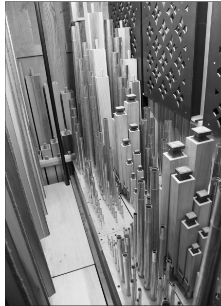
Harrison & Harrison Great Organ