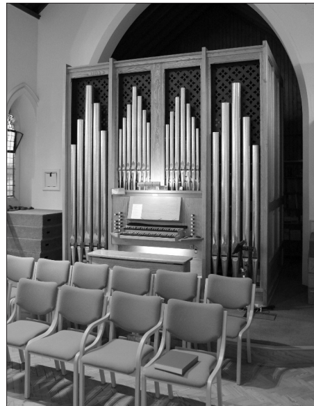
The Drive Methodist Church, Sevenoaks Harrison & Harrison 2001

console on to the large east wall of the church, for all to see. Members were keen to try the organ and others were able to view the organ's interior through a side panel door which had been opened for us. This is an enjoyable instrument, both visually as well as tonally; Harrison's creditable construction and considered