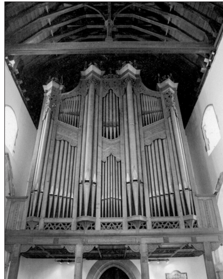
The 1936 west end organ, Hythe

What would be the ideal solution? Two organs, one in the nave and another in the chancel would require two players or an uncluttered migration route and a nimble organist. More practically, an optimum might be a divided instrument consisting of two parts each of which