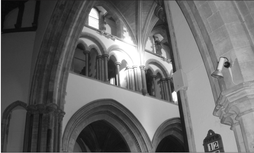
Set high in chancel a two-manual and pedal instrument of 13 speaking stops, including a 16ft reed