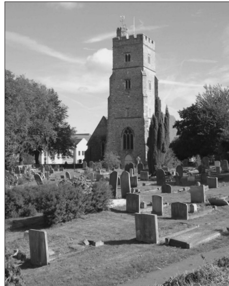
Rainham, a tranquil scene

Be wary of any future contact with my Wizard and his Glamorous assistants residing in that far-off land, for he who sups with this Mighty Wizard and his Glamorous assistants needs an exceedingly long spoon.