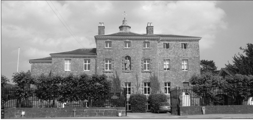
1732 Sevenoaks School building