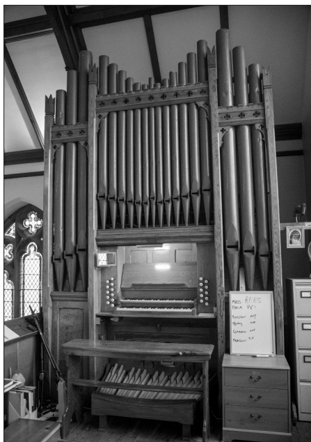
Griffin and Stroud 1903

Changes were made to the organ in 2009 by FH Browne at the instigation of Mr. Downar. A balanced swell pedal was fitted, a 22/3 rank replaced the Dulciana and a two rank Mixture the Clarionet on the Great. The specification is now: Great 8 8 8 4 4 2 22/3 11 Swell 8 8 8 8 4 8 8 Pedal 16 8 usual couplers including Swell octave to Great. It now has a full and vital chorus, and in the generous acoustic is more impressive than the specification might suggest. Members very much