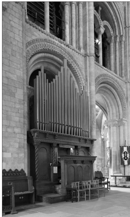
Romsey Abbey 1858 J W Walker with Barker Lever actions

In an attempt to demystify the innards of the Barker lever I hope that the diagrams help. They are schematic diagrams to show the working principle involved. Basically there are two interconnected valves, a pneumatic motor and connections to the key and to the