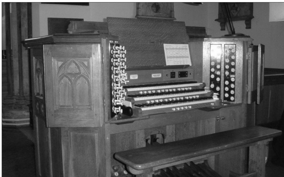
The console on a mobile platform, normally sited in the South Transept

when the console was made mobile and relocated to the nave floor level. It is normally sited in the South Transept, within uninterrupted earshot of both sections and about equidistant from each, but migrates to the nave south aisle when there is no singing choir in the summer, and for recitals is moved to the centre of the chancel steps.