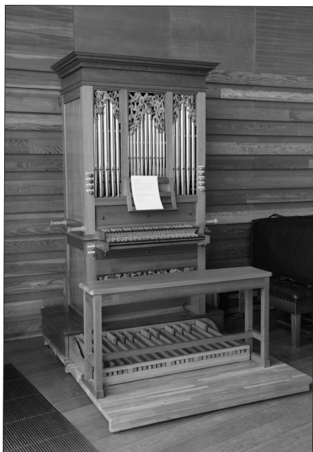
Spanish organ by Grenzing