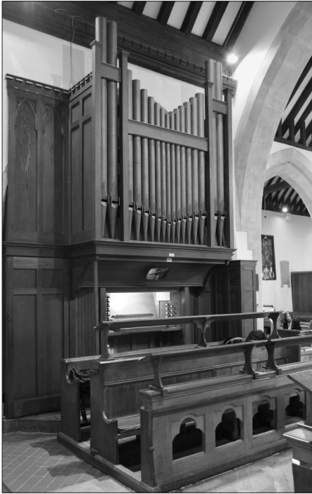
1913 Spurden Rutt, Otford

tonal design producing an organ well suited to its task.